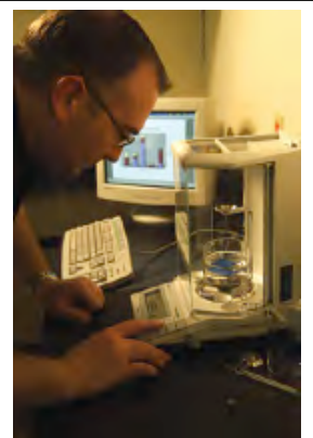
Quality control lab managers carefully measure finished film against customer parameters.

The third area to which Argotec is committed is the strict adherence to customer specifications. The company philosophy is that, once agreed upon, the customer's requirements are the benchmark against which all resulting film is measured. Changes to Argotec's standard operating conditions or procedures, be they alterations to either the engineered recipe or process